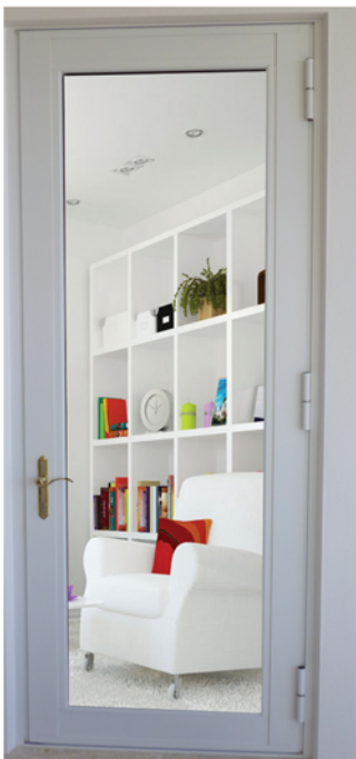
More Highlights On The Back